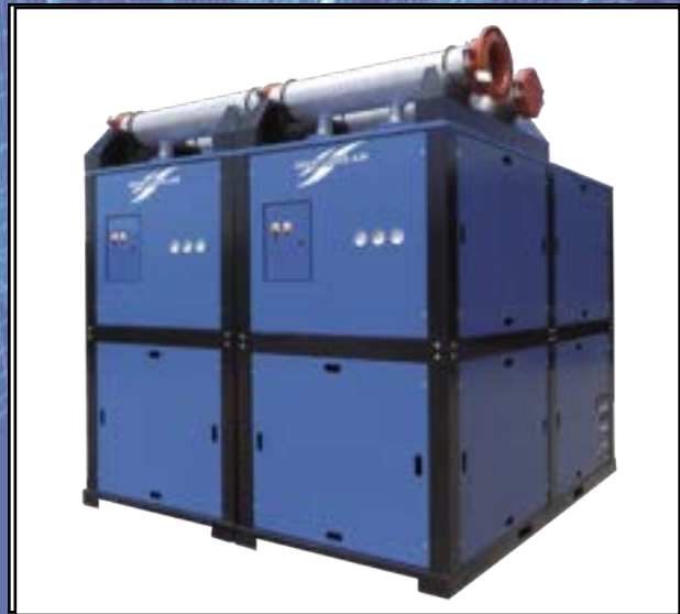
GMNX Series High Capacity Cycling Air Dryer