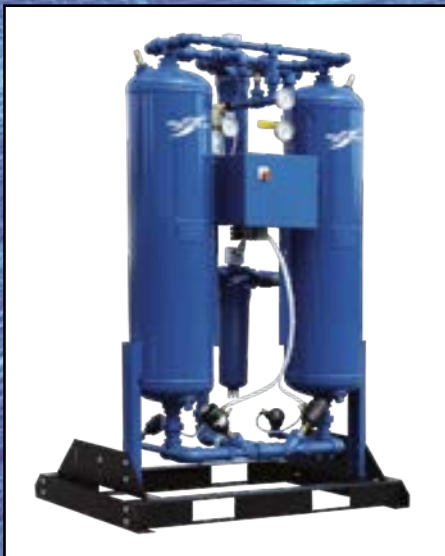
Regenerative Desiccant Air Dryers