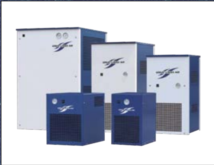
GRN Series Refrigerated Air Dryer