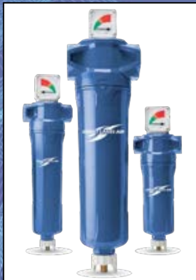
Compressed Air Filtration